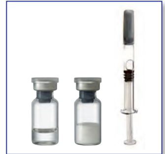
Proven delivery systems to optimize your development approach

Our premium manufacturing and clinical supply site near Chicago, Illinois, has the people, processes, and technology to serve pharma and biotech companies of every size with customizable solutions for drug compounds in any stage from Preclinical Testing to Phase II and beyond. As a strategic partner with a global network of excellence, we provide proven drug delivery systems specifically designed for the clinical needs and timelines of your complex compound.