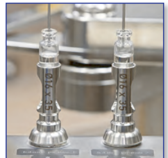
Fully automated vial filler