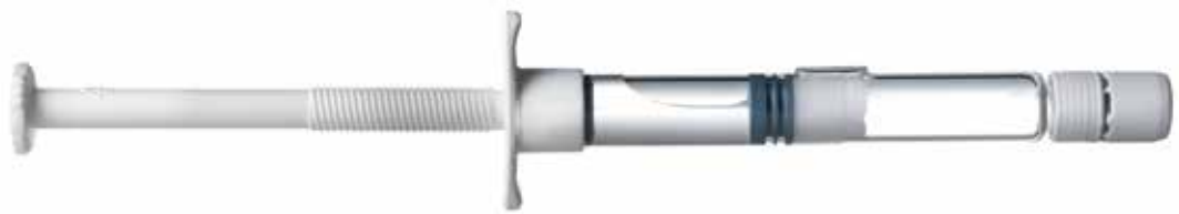
Example: Vetter Lyo-Ject® dual-chamber syringe 1.0 ml

Vetter's patented dual-chamber technology allows different ingredients and solvents to be prefilled and stored separately, then easily mixed and administered as needed. Dual-chamber systems can be used for lyophilized/solvent drugs, and liquid/liquid drugs and offer your sensitive compound many advantages.