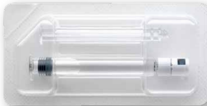
Example: Blistered sWFI-Syringe 3.0 ml