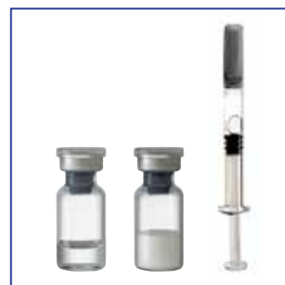
Proven delivery systems to optimize your development approach

Our premium manufacturing and clinical supply site near Chicago, Illinois, has the people, processes, and technology to serve pharma and biotech companies of every size with customizable solutions for drug compounds in any stage from Preclinical Testing to Phase II and beyond. As a strategic partner with a global network of excellence, we provide proven drug delivery systems specifically designed for the clinical needs and timelines of your complex compound.