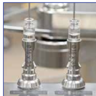
Fully automated vial filler